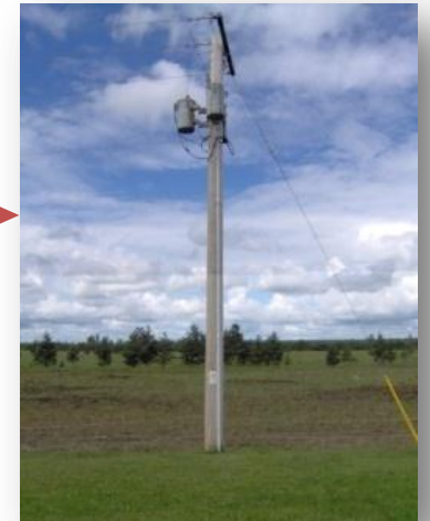
Connecting the CHP to the grid