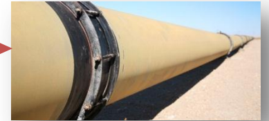
Connecting to natural gas pipelines